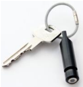
1 – RFID key holder plug and vandal-proof keyring