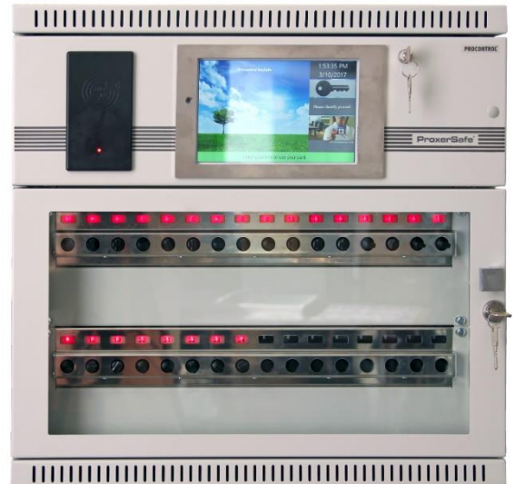
2 – KeySafe Lock 24/32 key cabinet