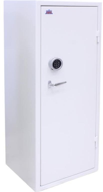
6 – KeySafe Security