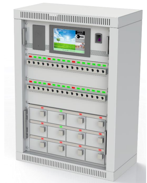
4 – ProxerSafe Combo with 32 key holder plugs and 12 small boxes